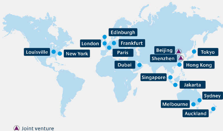
▲ Joint venture

Our approach to investment is driven by a commitment to providing the best possible outcomes over the long term for our investors. To achieve this, we ensure our interests are aligned with our investors and uphold a culture of always acting in our clients' best interests.