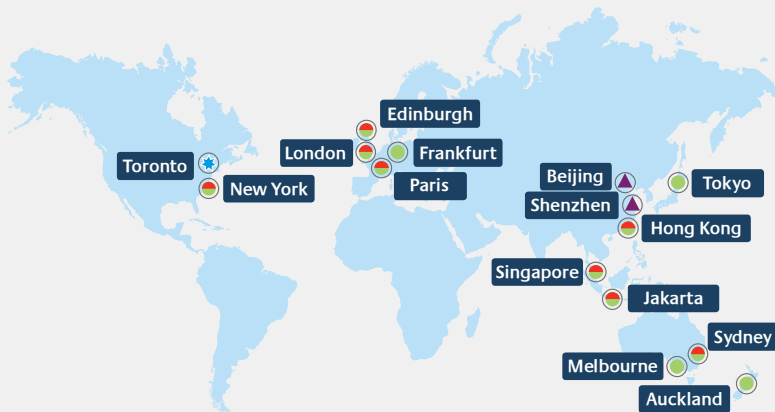
● Portfolio management team ● Distribution team ▲ Joint venture ★ Strategic alliance – HIM Money, Inc.

Our approach to investment is driven by a commitment to providing the best possible outcomes over the long term for our investors. To achieve this, we ensure our interests are aligned with our investors and uphold a culture of always acting in our clients' best interests.