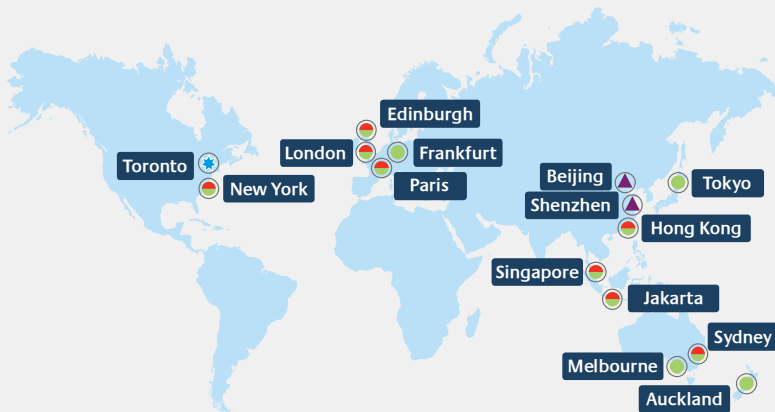
● Portfolio management team ● Distribution team ▲ Joint venture ★ Strategic alliance – HIM Money, Inc.

Our approach to investment is driven by a commitment to providing the best possible outcomes over the long term for our investors. To achieve this, we ensure our interests are aligned with our investors and uphold a culture of always acting in our clients' best interests.