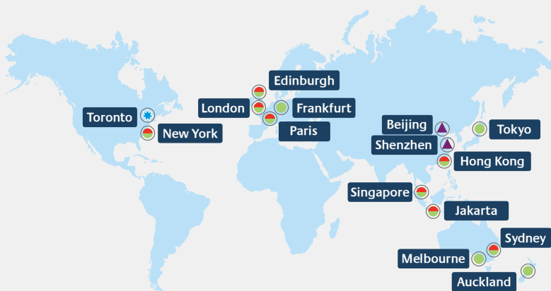
● Portfolio management team ● Distribution team ▲ Joint venture ★ Strategic alliance - HIM Money, Inc.

Our approach to investment is driven by a commitment to providing the best possible outcomes over the long term for our investors. To achieve this, we ensure our interests are aligned with our investors and uphold a culture of always acting in our clients' best interests.