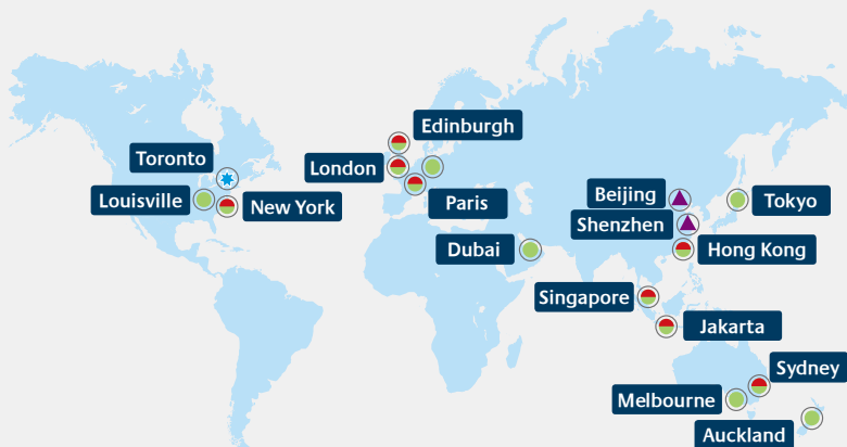
● Portfolio management team ● Distribution team ▲ Joint venture ★ Strategic alliance - HIM Money, Inc.

Our approach to investment is driven by a commitment to providing the best possible outcomes over the long term for our investors. To achieve this, we ensure our interests are aligned with our investors and uphold a culture of always acting in our clients' best interests.