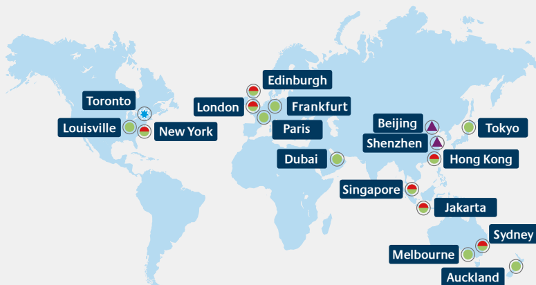
● Investment team ● Distribution team ▲ Joint venture ★ Strategic alliance - HIM Money, Inc.

Our approach to investment is driven by a commitment to providing the best possible outcomes over the long term for our investors. To achieve this, we ensure our interests are aligned with our investors and uphold a culture of always acting in our clients' best interests.