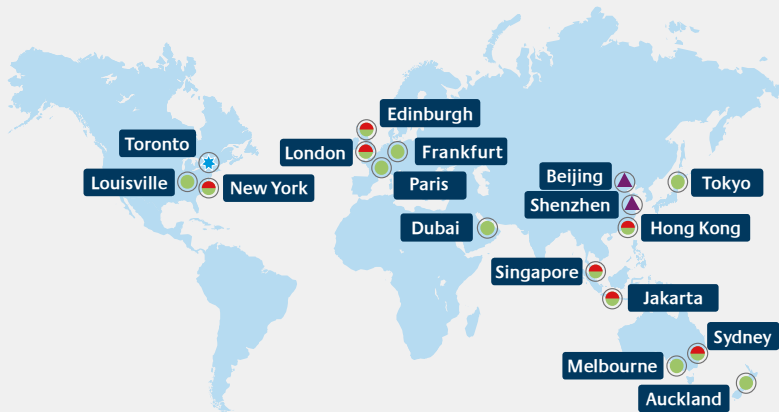
● Investment team ● Distribution team ▲ Joint venture ★ Strategic alliance - HIM Money, Inc.

Our approach to investment is driven by a commitment to providing the best possible outcomes over the long term for our investors. To achieve this, we ensure our interests are aligned with our investors and uphold a culture of always acting in our clients' best interests.