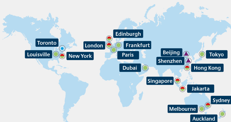
● Investment team ● Distribution team ▲ Joint venture ★ Strategic alliance - HIM Money, Inc.

Our approach to investment is driven by a commitment to providing the best possible outcomes over the long term for our investors. To achieve this, we ensure our interests are aligned with our investors and uphold a culture of always acting in our clients' best interests.