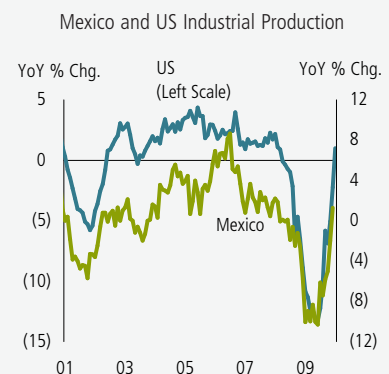
Display 2 Mexico Piggybacks on US Recovery