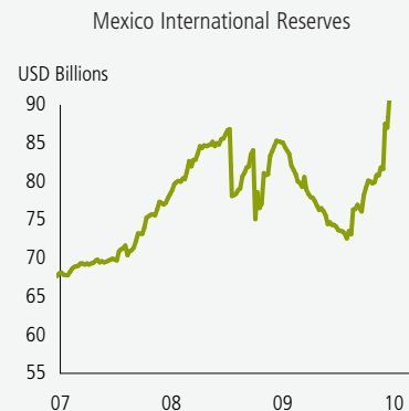
Display 1 Mexico’s Reserves Soar Under New Plan

The second positive development for Mexico is the substantial progress it has made on the fiscal front. Last year, the government passed a 2010 budget that incorporated measures necessary to reduce