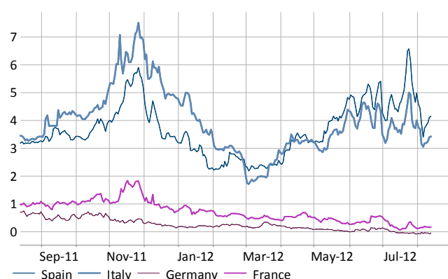
2-year bond yields (in %)

For our analysis on the ECB's Governing Council meeting on 2 August, please see our Flash note No big step from the ECB . Since then, several official comments were made in order to dampen expectations about rapid bond purchases. No surprise that the more severe comments are from Germany with former ECB chief economist Otmar Issing stating that ECB bond buying is wrong. Benoît Coeuré (member of the ECB's executive board) stressed the irreversibility of the euro but claimed that the ECB should ensure that central bank loans help small and medium-sized enterprises and consumers. Mario Draghi made it clear and simple: the Spanish government now has the floor. If Mr. Rajoy does not officially seek EFSF's aid (and accept conditionality), nothing will happen. Time for action has not come yet in the eurozone but it is noteworthy that, until then, the magic "whatever it takes" Mario Draghi's formula seems to be efficient on peripheral rates (see chart) despite the lack of details.