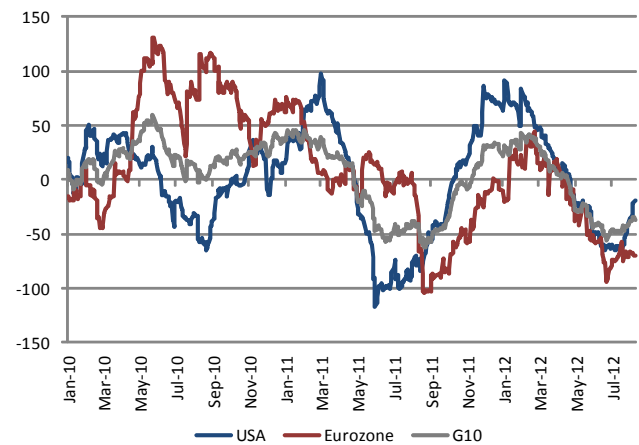
Economic Surprise indicators (as of 13 August 2012)

The JPMorgan Global Output PMI rose slightly from June to July thanks to an improvement in services. Nevertheless, at 51.7, the composite PMI is one of the weakest in three years. Moreover, new orders and employment components are boding ill for the coming months. The eurozone is seriously lagging as activity contracted for the sixth month in a row, while the US manufacturing Ism was below 50 for the second consecutive month (49.8 in July). Remember that the 50 threshold is the dividing line between expansion and contraction in industry and that, according to the Institute for Supply Management, no recession occurs throughout the economy until the ISM manufacturing index is below 42.6. The economic momentum in the US has stopped deteriorating since mid-July as illustrated by the economic surprises” index, which expresses the gap between market economists’ expectations and the data actually published. It is still in negative territory but improved from -60 to -20.