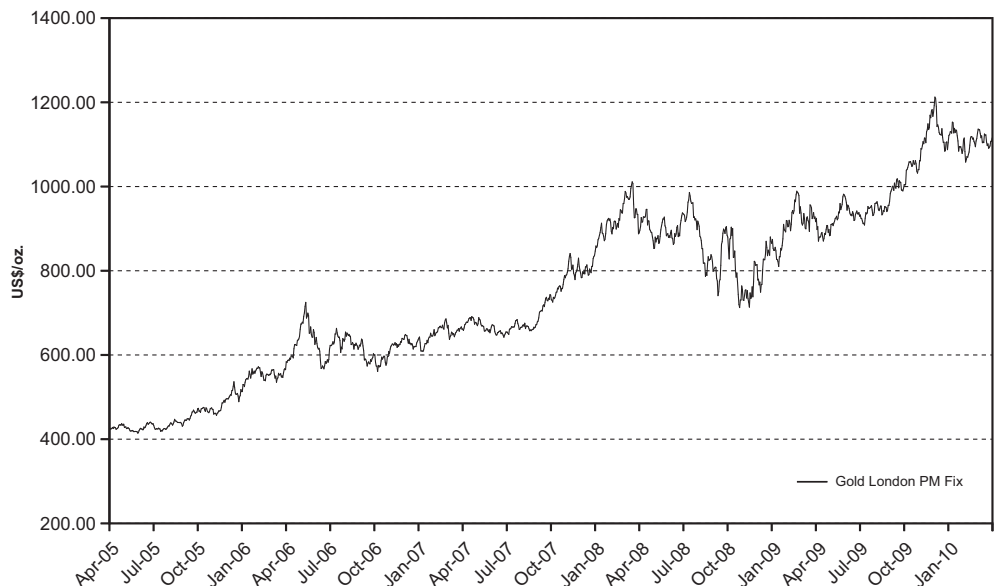
Daily gold price - April 1, 2005 to March 31, 2010

After reaching a 20-year low of $252.80 per ounce at the London PM fix on July 20, 1999, the gold price gradually increased. The average gold price for 2004 was $409.17 per ounce, the average for 2005 was $444.45 per ounce and the average for 2006 was $603.77. In 2007, the average gold price for the year was $695.39 per ounce. After trading between $608.40 (January 10) and $691.40 (April 20) for the first eight