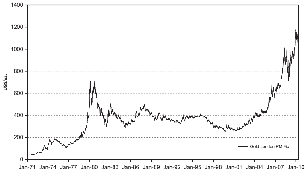
Daily gold price - January 1, 1971 to March 31, 2010

The following chart illustrates the movements in the price of gold in US dollars per ounce over the five year period from April 1, 2005 to March 31, 2010, and is based on the London PM fix.