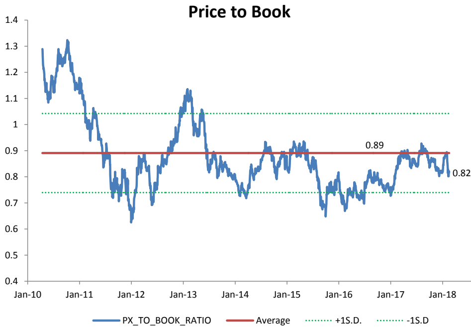
Figure 2. CAPL trades at lower than post GFC average Price/NAV of 0.89