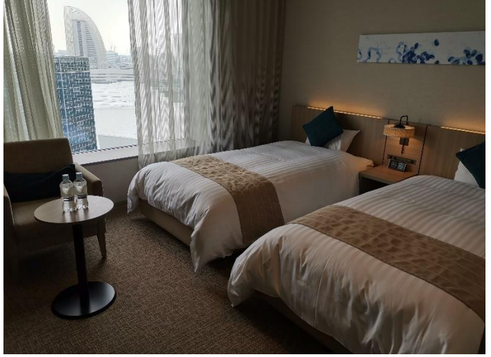
Figure 5: Showroom - Superior Twin Room