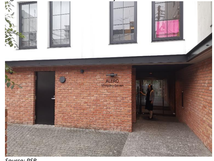
Figure 10: Front view of ALERO Shinjuku-Seven