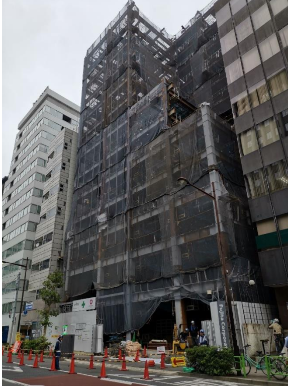
Figure 1: Construction site of Hotel Vista Tokyo Tsukiji

The hotel a 4-minute walk to Higashi-Ginza station. It takes 34 minutes from the station to Haneda airport and 80 minutes to Narita airport.