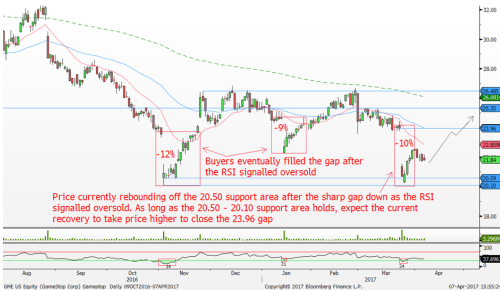
GME daily chart